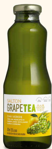
GREEN TEA WITH MOSCOTTO GRAPE, SICILIAN LEMON AND LEMONGRASS FLAVOUR

In order to have more lightness and balance in your day-to-day, the Grape Tea Salton collection combines the benefits of tea with the healthiness of grapes and becomes an unprecedented product with an intense taste. The flavour blends from this line are also enriched with B-complex vitamins and vitamin C.