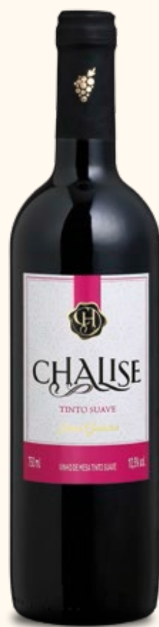
SWEET RED WINE