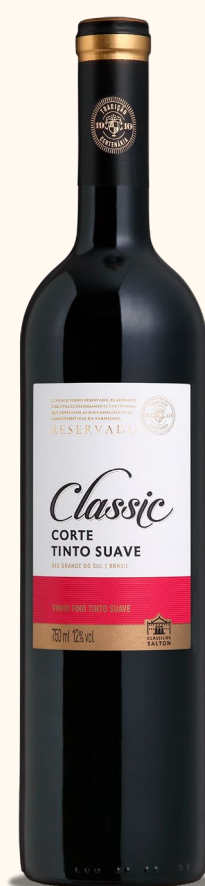
SWEET RED BLEND