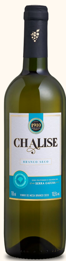
DRY WHITE WINE