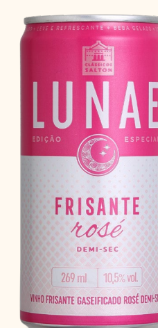
LUNAE DEMI-SEC ROSÉ