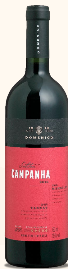
DOMENICO SALTON CAMPANHA MARSELAN/TANNAT

PAIRING Canapés, salads with leaves and fruits, sushi and sashimi, seafood, light dishes with white meats.