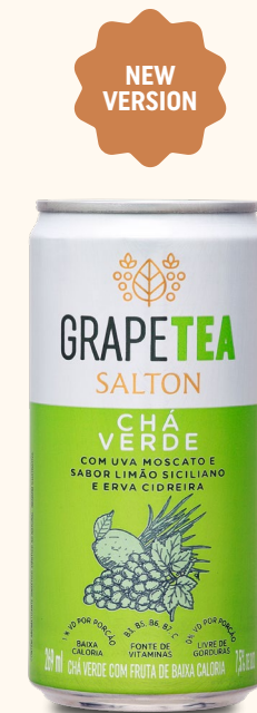
GREEN TEA WITH MOSCOTTO GRAPE, SICILIAN LEMON AND LEMONGRASS FLAVOUR