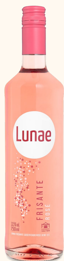
LUNAE DEMI-SEC ROSÉ

Lunae Frizzantes have a pleasant flavour and fine bubbles that refresh and combine with the lightness of everyday life. Salton Lunae Drinks Clericot are now part of the line, some ready-to-drink cocktails.