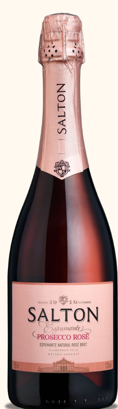
SALTON PROSECCO ROSÉ