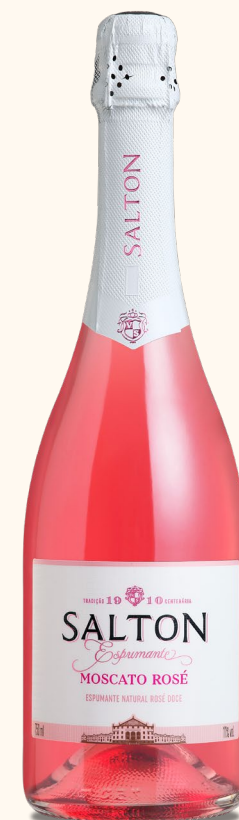
SALTON MOSCATO ROSÉ