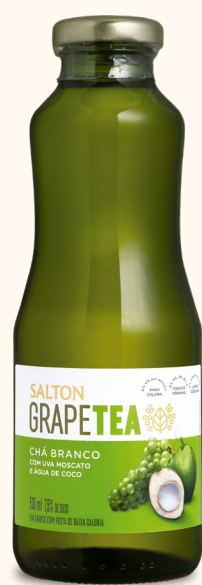
WHITE TEA WITH MOSCOTTO GRAPE AND COCONUT WATER