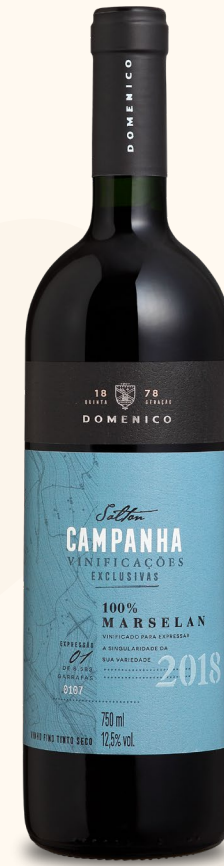
DOMENICO SALTON CAMPANHA MARSELAN

PAIRING Matured cheeses, stuffed pasta, roasted red meats.