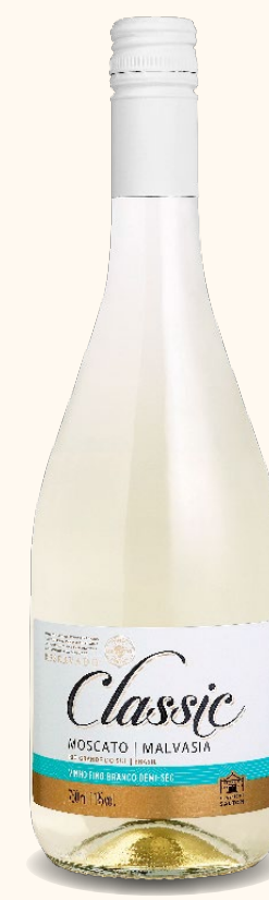
DEMI-SEC WHITE BLEND