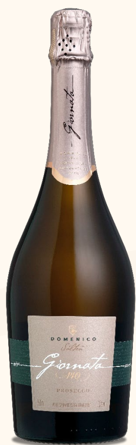
DOMENICO SALTON GIORNATA 140

They are special labels, produced through experimentation, where winemakers are free to rethink the processes at each stage, and make small changes to express the uniqueness of each element involved, from the soil to the fruit, from fermentation to maturation.