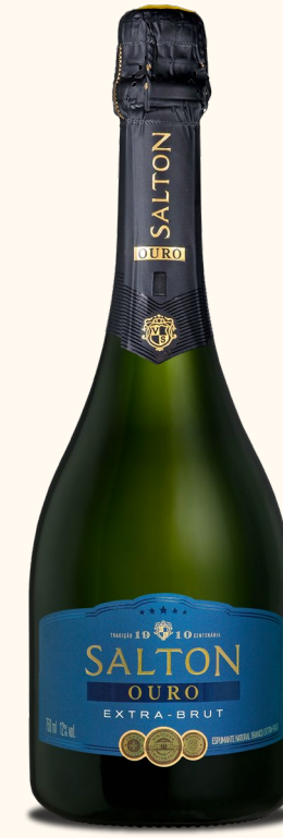
SALTON OURO EXTRA-BRUT

PAIRING Cheeses, white meats, light risottos