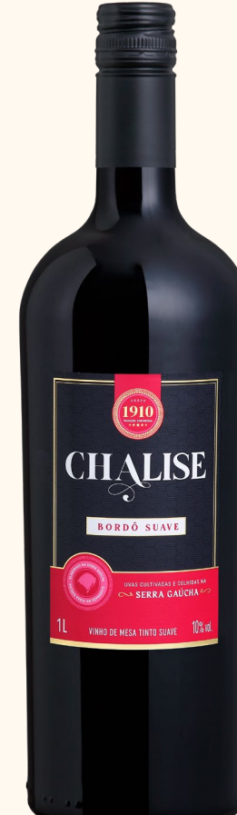
SWEET RED WINE