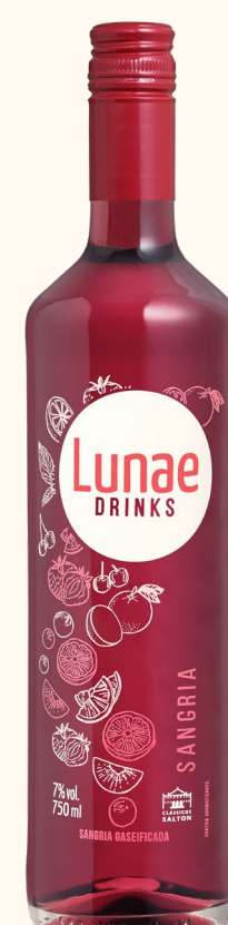
LUNAE DRINKS SANGRIA