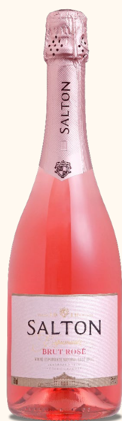
SALTON BRUT ROSÉ