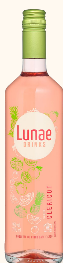
LUNAE DRINKS CLERICOT