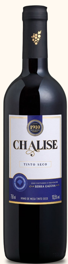
DRY RED WINE

Chalise brand labels, made with grapes from Serra Gaúcha, uncomplicated wines with excellent value for money. Light and easy to drink, they are ideal to enjoy the lightness of everyday life.