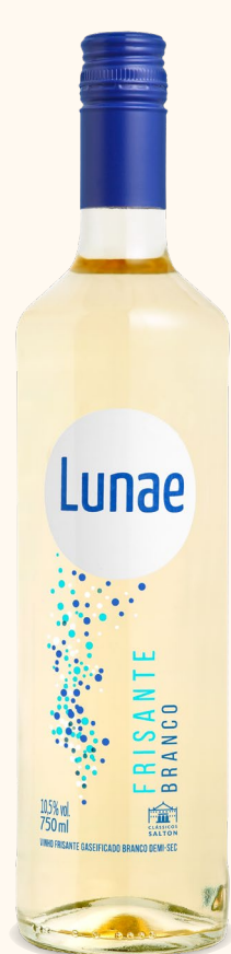
LUNAE DEMI-SEC WHITE