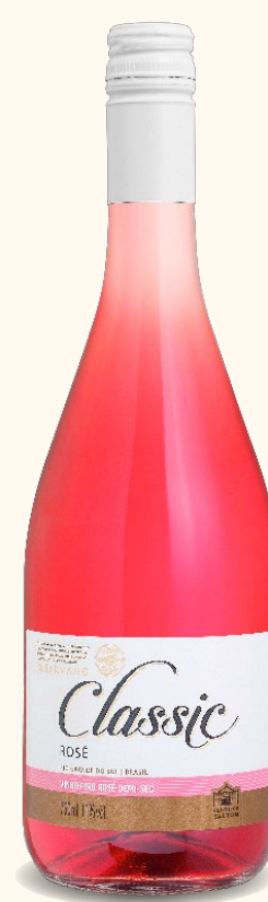
DEMI-SEC ROSÉ BLEND