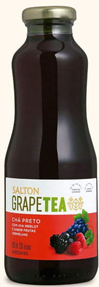
BLACK TEA WITH MERLOT GRAPE AND RED FRUIT FLAVOUR