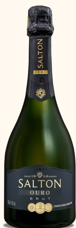
SALTON OURO BRUT