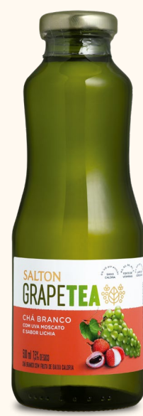
WHITE TEA WITH MOSCOTTO GRAPE AND LYCHEE FLAVOUR