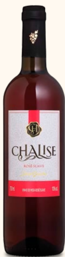
SWEET ROSÉ WINE