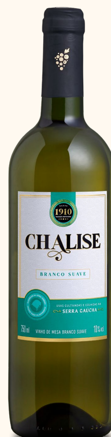
SWEET WHITE WINE